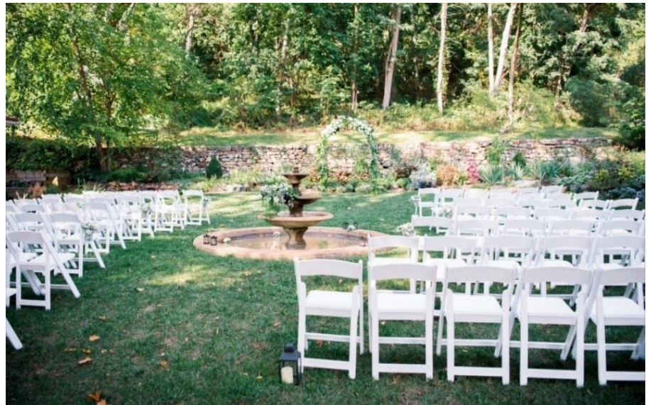
Garden Ceremony Set Up

We have three outdoor ceremony spots you are going to see; each one is breathtaking in its own right.