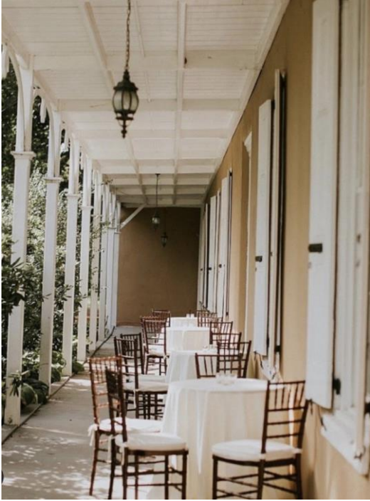
Washington Breezeway & Portico

This garden space is actually one of the choices for your ceremony