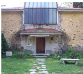
Studio Barn & Clay Studio