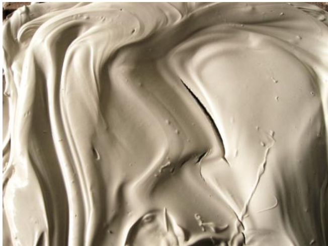
Drying porcelain

This class is for students who have had some experience making pots and who would like to learn to handle this soft and sensuous clay. We'll be decorating with color, carving on porcelain, and taking advantage of the characteristics of porcelain that makes it so appealing. This class will include both hand building and wheel throwing.