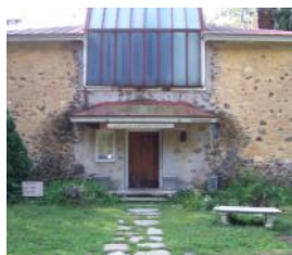
Studio Barn & Clay Studio