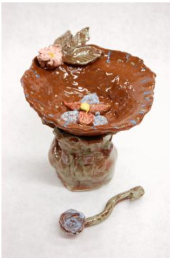
Ice Cream Bowls Photos by Heidi Brett

Using stories and imagination as inspiration, we will create ceramic objects including usable pots and fanciful sculptures. Possible projects include seasonal mobiles, bird baths, memory mugs and more. Through this exploration, students will learn basic ceramic methods such as pinch, slab and coil pots, rolling cylinders, altering shapes and applying surface textures and colors.