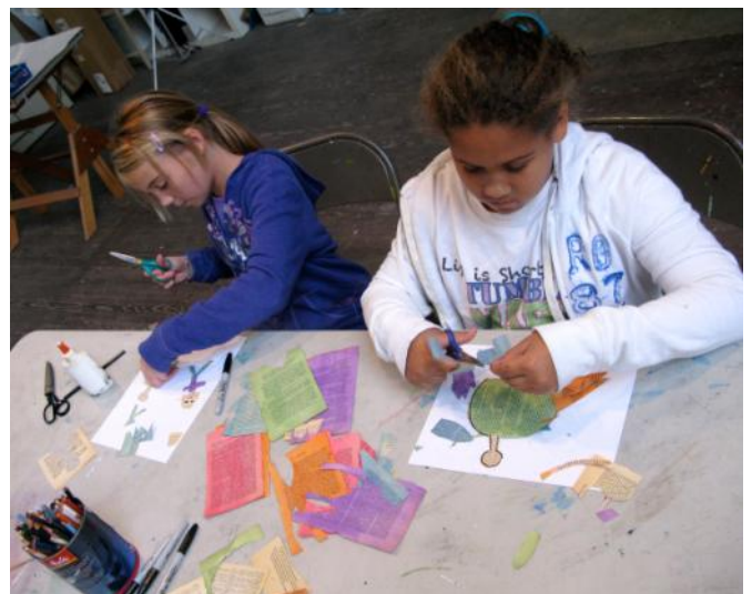
Children's Workshop

We will reclaim, reuse and recycle found objects and ordinary materials into new 2-D and 3-D works of art.